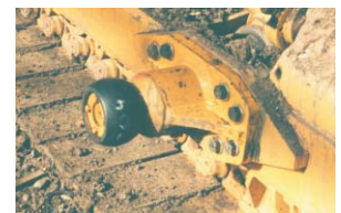
Optional IMAC Trunnion Balls featuring a Replaceable Ball