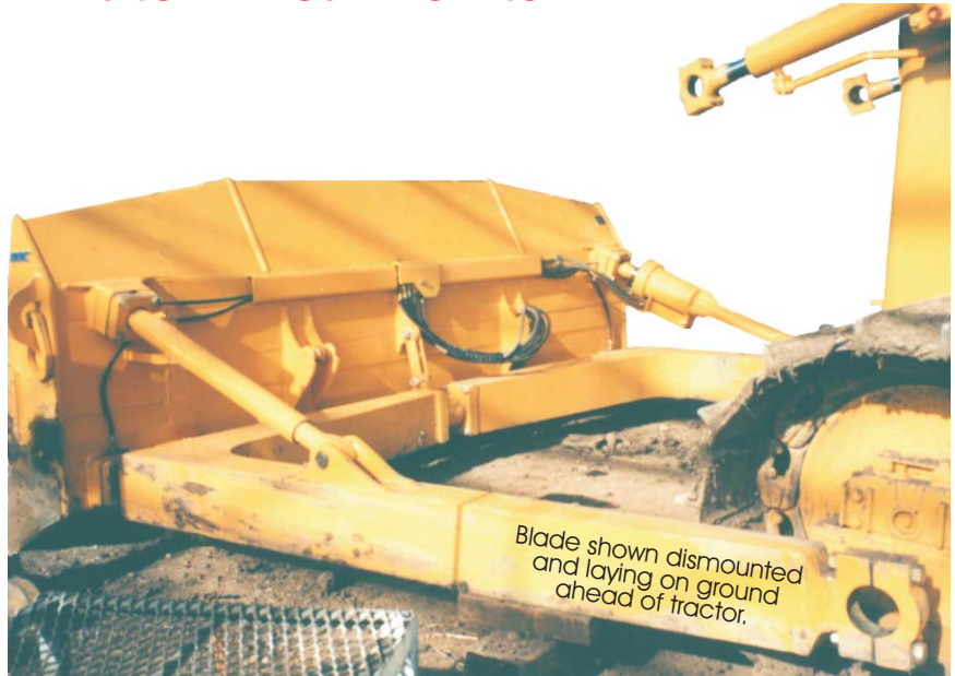
Blade shown dismounted and laying on ground ahead of tractor.

IMAC's exclusive Resilient Uni-Joint permits movement between Push Group Members