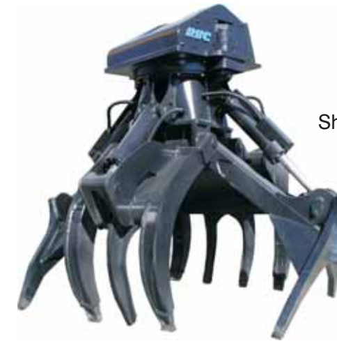
Hybrid Grapple Mix and Match Shortwood Arms and Outriggers on one grapple frame

MCD - Modular Component Drive Drop in rotation drive system featuring support bearings on both sides of the pinion for longer pinion life